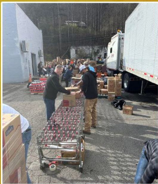
Teams assist MWOA during the recent distribution in Delbarton, W.V.

In ongoing disaster relief, MWOA dispatched a total of 22 teams and delivered three containers of materials to the residents of Western North Carolina in wake of the destruction of Hurricane Helene.